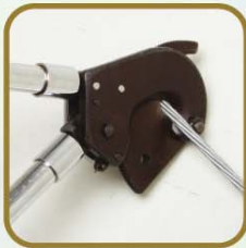
Ideal cutting capability