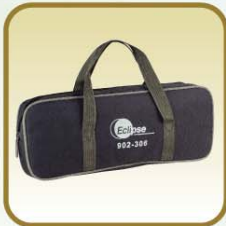
Packaged with a bag