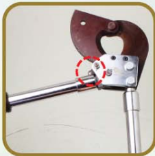
Ratchet release design